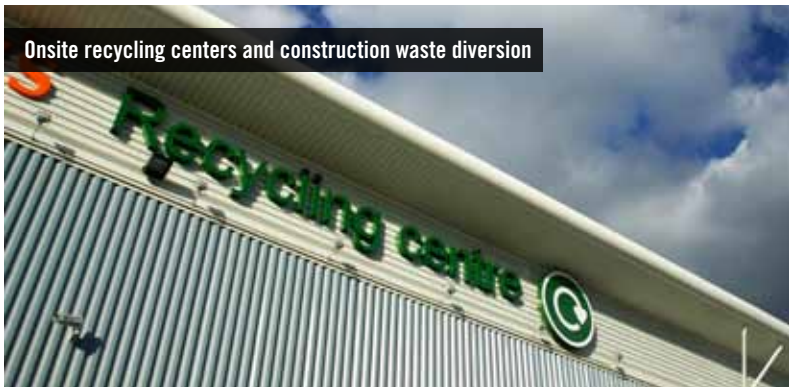
Onsite recycling centers and construction waste diversion