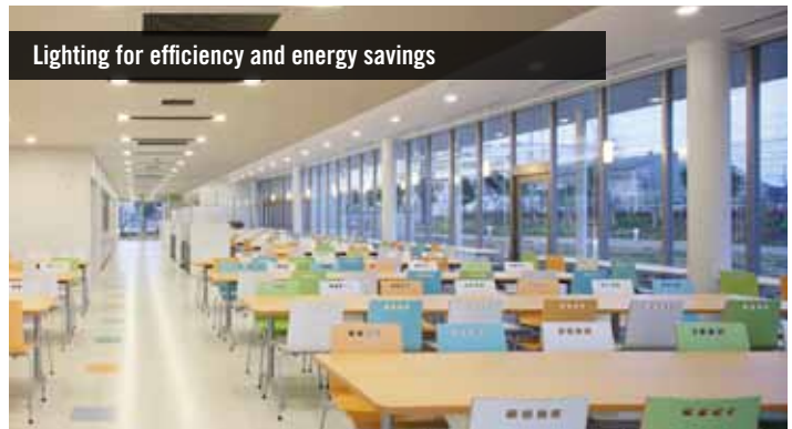
Lighting for efficiency and energy savings