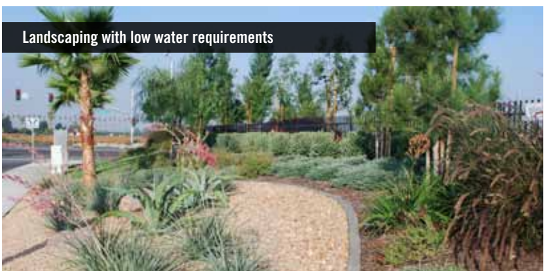
Landscaping with low water requirements